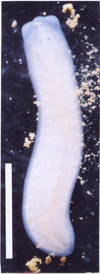
8 Phagocata papillifera